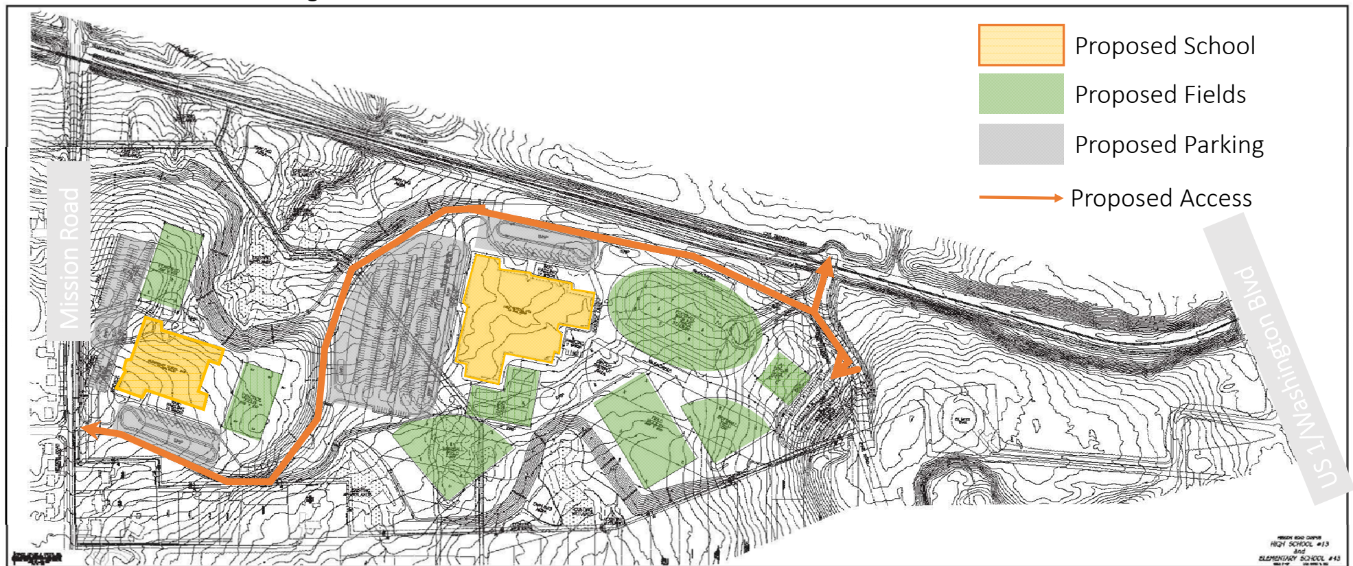
Mission Road Base Grading Plan