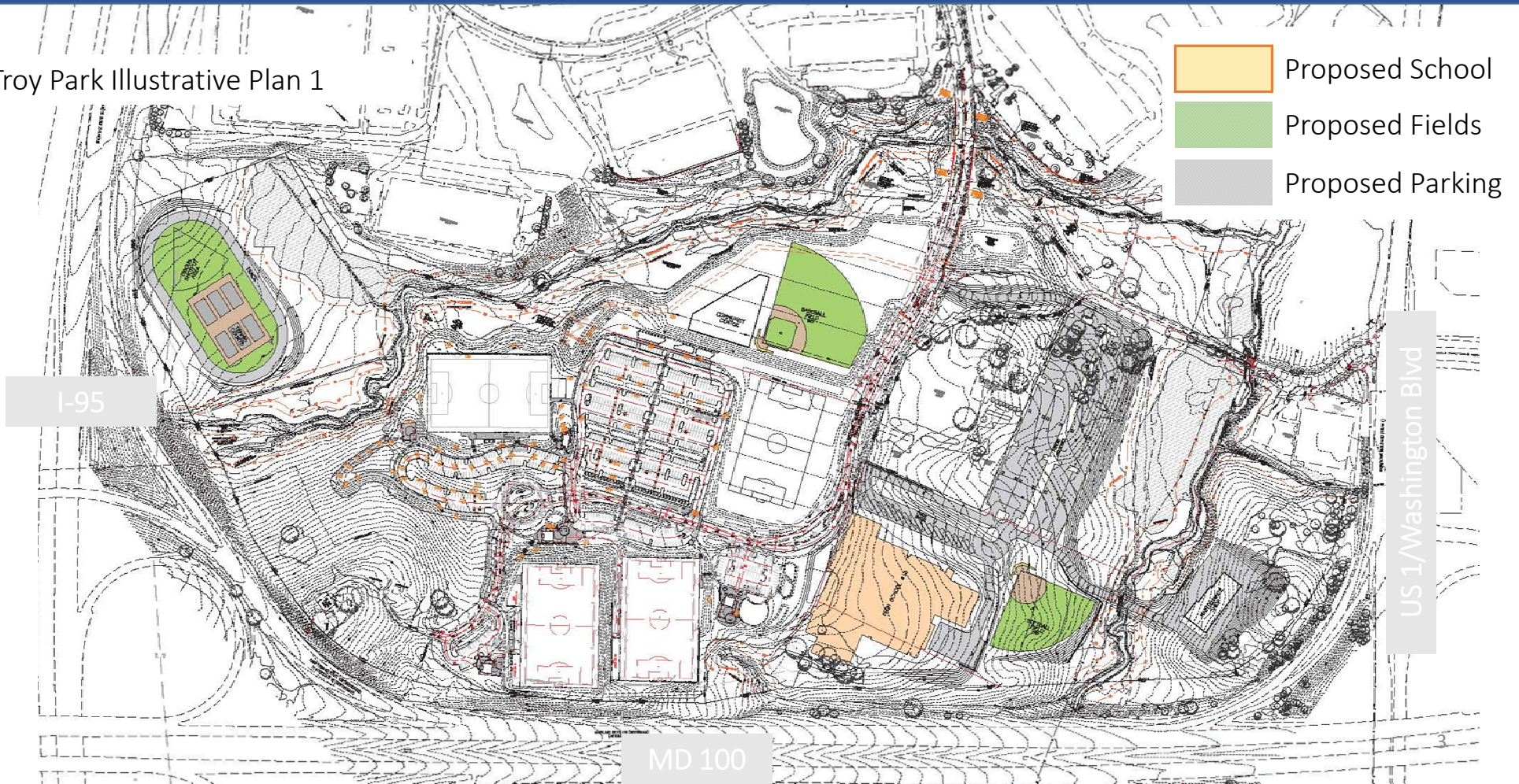
Troy Park Illustrative Plan 1